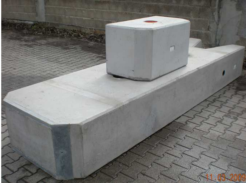
Picture: MD counter jib ballast CA 4200 kg and CB 700 kg