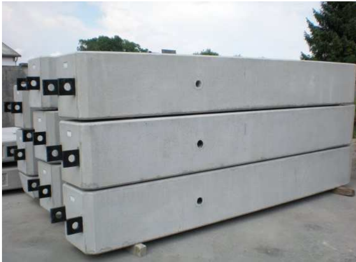
Picture: MDT counter jip ballast CBU 3070