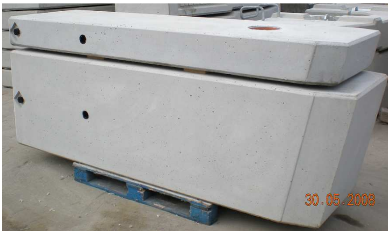
Picture: MDT City counter jib ballast CAU 3600 kg and CAV 1100 kg